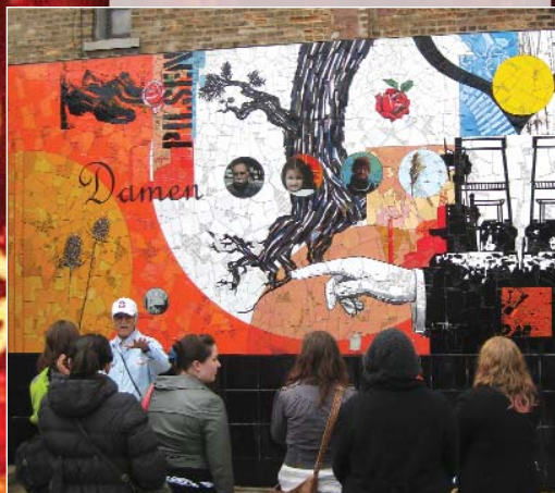
A field visit to view murals in the Pilsen neighborhood.