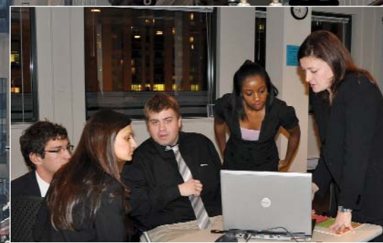
A project team of students works with program faculty to fine-tune a business presentation.