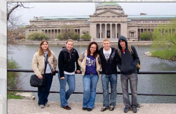
Chicago Program students at the Museum of Science and Industry.

At the center of the country, Chicago has always been a hub of communication, commerce, and transportation. Through the years, Chicago has continued to produce leaders across the spectrum of its artistic, business, educational, activist, social, and cultural arenas.