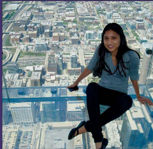
A student on the glass-enclosed "Ledge" extending out from the 103rd floor of the Willis Tower, overlooking Chicago's West Loop.