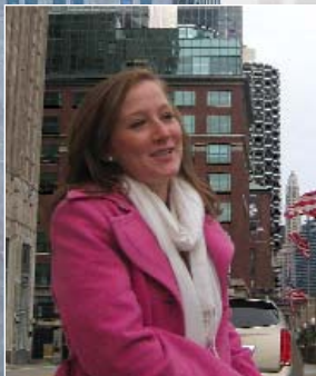
A student in front of the Merchandise Mart, where her internship was located.

Creativity, innovation, problem-solving — all are fundamental tools used by successful entrepreneurs. Whether they are creating new products, opening new markets, or