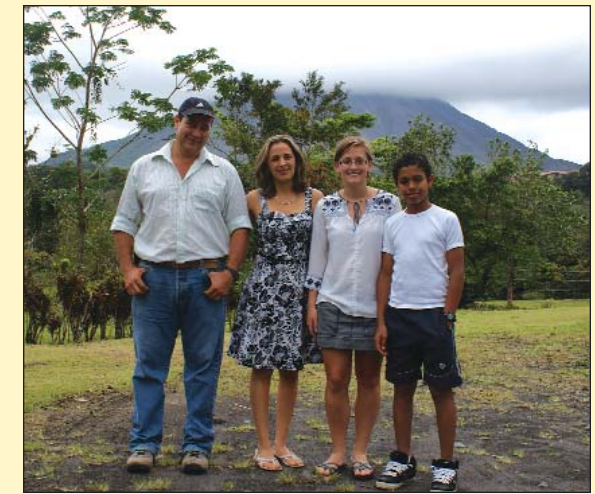
A student with her rural host family.

The ACM Costa Rica programs give students an in-depth experience with the people and culture of this beautiful, diverse nation.