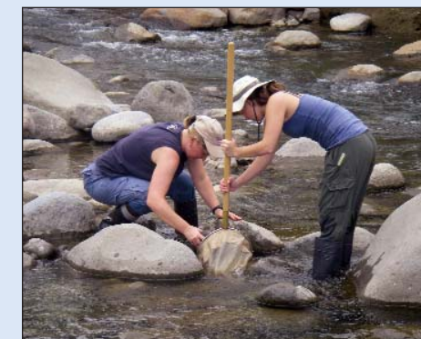
A student collecting macroinvertebrate (aquatic insect) samples with her advisor in the Caño Grande, in Venecia.

Research advisors Prominent research specialists and scholars assist students in all aspects of the research process, from proposal preparation to field work to writing and presenting the paper.