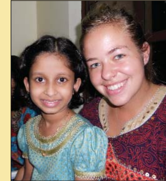
A student with her host sister.

Living arrangements During the first week of the program, students stay as a group in a hotel. For the rest of the program they live with host families in Pune, who provide two meals each day.