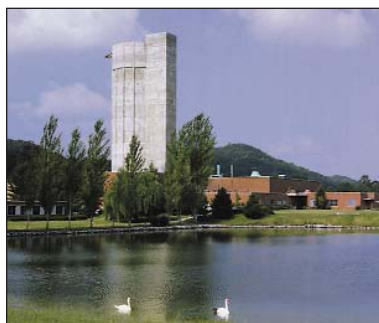
At right: ORNL's Holifield Radioactive Ion Beam Facility.

Some highlights of the research areas at ORNL are listed below.