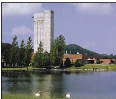
At right: ORNL's Holifield Radioactive Ion Beam Facility.

Some highlights of the research areas at ORNL are listed below.