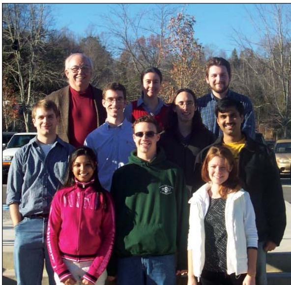
Oak Ridge Science Semester participants and resident faculty.

The Oak Ridge Science Semester is an exceptional opportunity for undergraduates to conduct research and work alongside career scientists at a premier facility, the Oak Ridge National Laboratory (ORNL). Students often find that this is the most demanding and rewarding experience of their college careers.