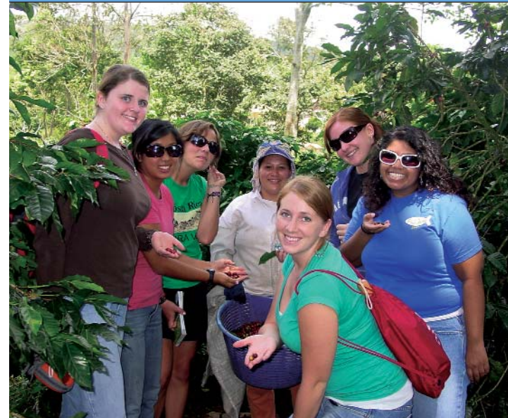
A student with his host family.

The ACM Costa Rica programs give students an in-depth experience with the people and culture of this beautiful, diverse nation.