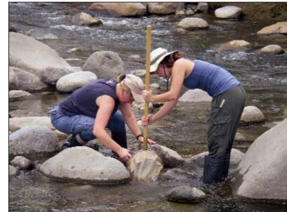
Above: A student collecting macroinvertebrate (aquatic insect) samples with her advisor in the Caño Grande, in Venecia. Left: Students learn the marimba at Escazú.