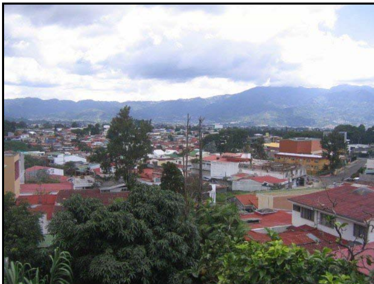
View from the ACM building.

You are expected, unless excused, to attend all ACM classes and events and to participate in the field trips. As a general rule, students will not be excused from ACM activities to attend to visitors from the United States, whether friends or family. As a courtesy to your fellow students and to your host family, be sure to attend all ACM social activities. Those who participate fully in the program will definitely benefit culturally and socially. Keep in mind that visitors may not take precedence over your academic responsibilities; a prolonged visit by family or friends causes an inevitable regression in your Spanish learning and may cause you to fall behind in your research.