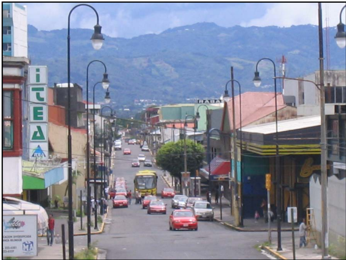
Downtown San José

In this environment, foreign students are received with great friendliness in both rural and urban areas. Because the quality of ACM students has been excellent in the past, the ACM enjoys a high level of cooperation from both private and government organizations with which the students work. We take all reasonable precautions but firmly believe that Costa Rica provides valuable educational resources and a peaceful, receptive environment for our academic programs.