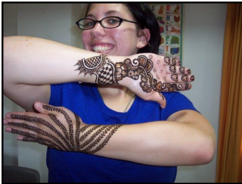
Henna.