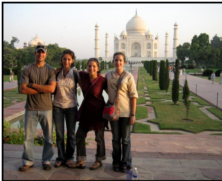
Students at the Taj Mahal.