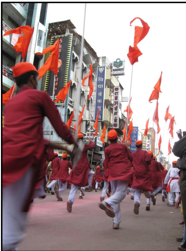
Ganesh Festival.

The Associated Colleges of the Midwest does not discriminate in the operation of its educational programs, activities, or employment on the basis of sex, race, creed, national origin, age, sexual orientation or disability.