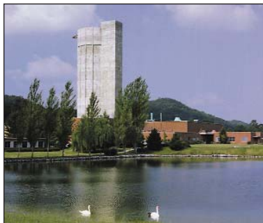
At right: ORNL's Holifield Radioactive Ion Beam Facility.

Some high-lights of the research areas at ORNL are listed below.