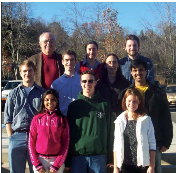
Oak Ridge Science Semester participants and resident faculty.

The Oak Ridge Science Semester is an exceptional opportunity for undergraduates to conduct research and work alongside career scientists at a premier facility, the Oak Ridge National Laboratory (ORNL). Students often find that this is the most demanding and rewarding experience of their college careers.